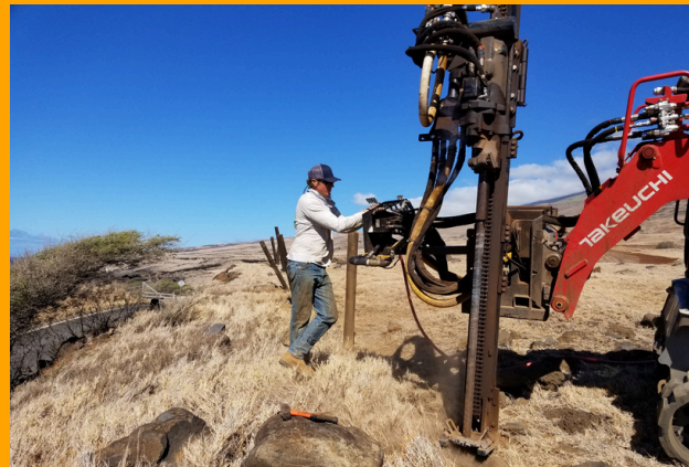
SS120 TOP HAMMER DRILL ATTACHMENT