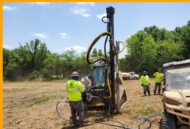
SS57/SS125 DOWN-THE- HOLE HAMMER DRILL ATTACHMENT